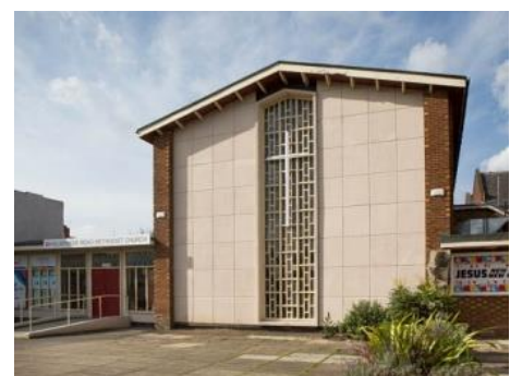
Holderness Road Methodists

The only other church now in the Parish is Holderness Road Methodist Church. For many years there has been a joint Good Friday service and walk of witness between the Methodist Church and St Columba's, and last year this was expanded to a bigger walk of witness along the Holderness Road with members from a number of other Anglican and non-Anglican churches in the area taking an active part.