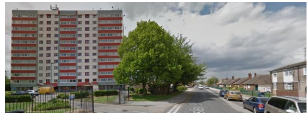
Barnsley St, at west end of Parish

The western end of the Parish has proved very difficult to reach as it is remote from the existing buildings with local authority clearance leaving small communities isolated from the main population areas. Whilst we have no short term plans to address this, long term a church plant may prove to be helpful in that location.