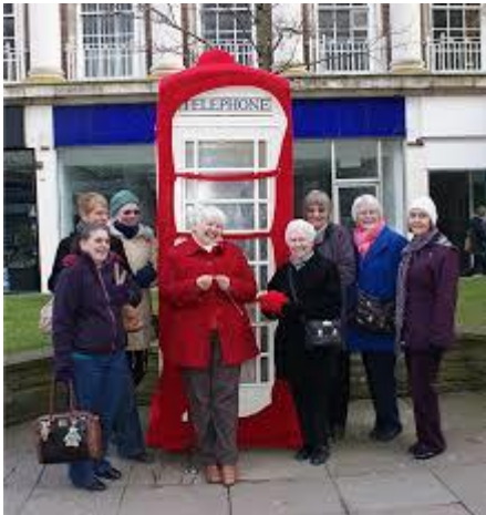
"Gorilla knitting" from St C's Knitwits, for Comic Relief

The Readers are very active in leading services and preaching and some gifted others, including the RPA's are also involved. Two of the Readers take Home Communion and occasional funeral services.