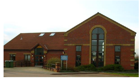
Victoria Dock Village Hall

Victoria Dock, a Church Plant of some 20 years ago, meets in the Village Hall. The area it serves is an up market redevelopment of a redundant dock and has the status of an urban village. Most of the core congregation have been there almost since the start. By its very nature the area does have a transient professional population which leads to turnover in church membership.