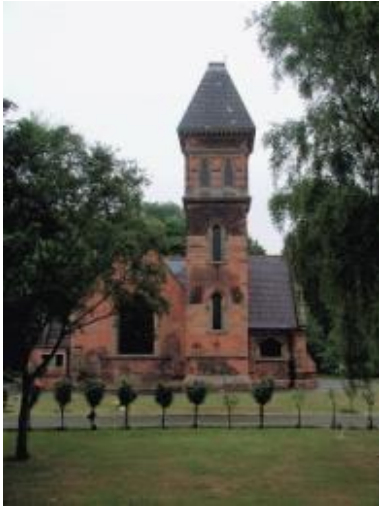
Hedon Road Cemetery

In the last 12 months the Team have conducted 15 funerals at the Crematorium, and in the previous year 16 funerals at the Crematorium.