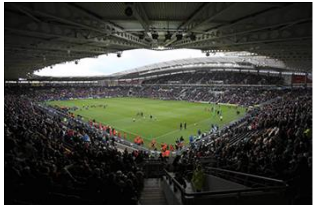
The KC Stadium