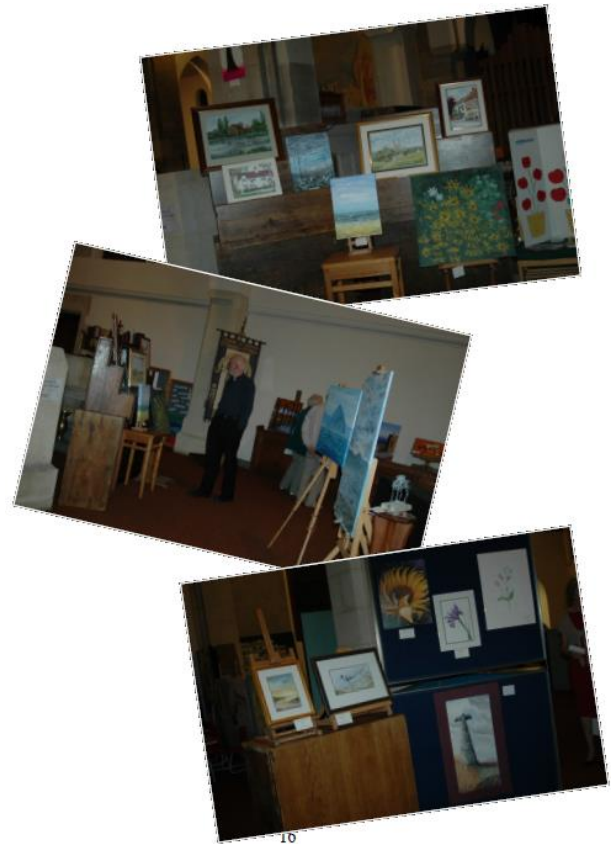
The Secret Artists