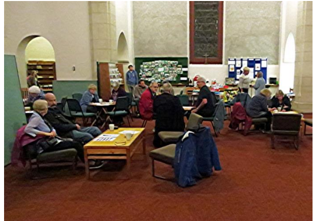
Quiz Night at St C's

Early in 2015 a decision was taken parish wide to engage with the ' Leading Your Church into Growth ' (LYCIG) course ahead of a planned initiative by the Diocese. To date two of the Churches have completed the course and the third has now started. The course has been enthusiastically received by the congregations, building up real energy and a desire to make things happen which will lead to real spiritual and numerical growth together with growth in service.