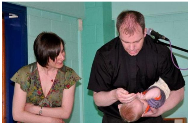
Christening at Vicky Dock

Victoria Dock has a sunrise service on Easter Day often overlooking the River Humber. They also hold approx 4 Messy Church gatherings a year. Last year saw the introduction of an outdoor Remembrance service.