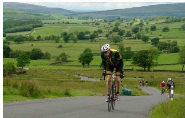
East Yorkshire Wolds (not in the Parish)

In 2011, Hull was named the "fourth best cycling city" and its flat landscape has led to the city having one of the highest numbers of cyclists for a UK city. The nearby Yorkshire Wolds, with their quiet roads and rolling chalk hills, offer perfect cycling country for the more energetic rider.