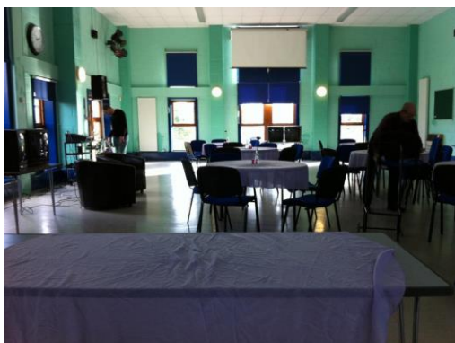
Setting up for monthly Café Church at Vicky Dock

Both St Columba's and St John's are Parish Churches.