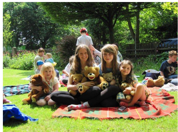
Teddy bears' picnic in St C's garden