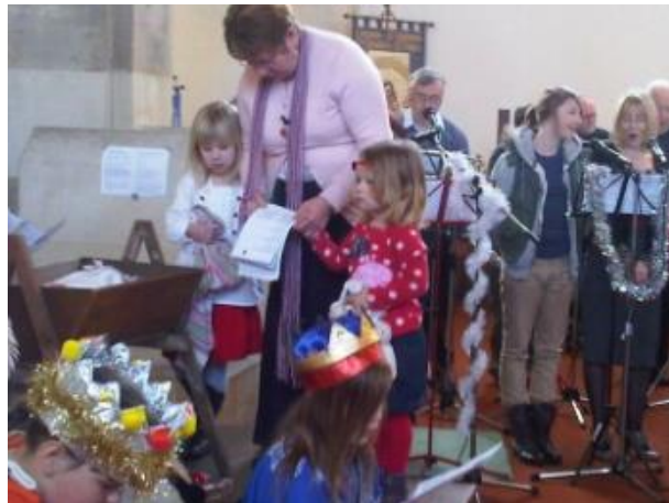
Reader led All Age Nativity

We have four Lay Readers and three Recognised Parish Assistants. Several other lay members are experienced in leading worship.