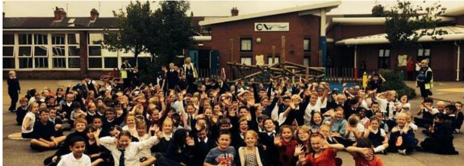
Escourt Street School

There are seven primary schools in the Parish; Buckingham Street , Craven , Escourt Street , Mersey Street , Stoneferry , Victoria Dock and Westcott Street schools. There are no church schools in the Parish, but a church primary , and a church secondary school just across the Parish Boundary.