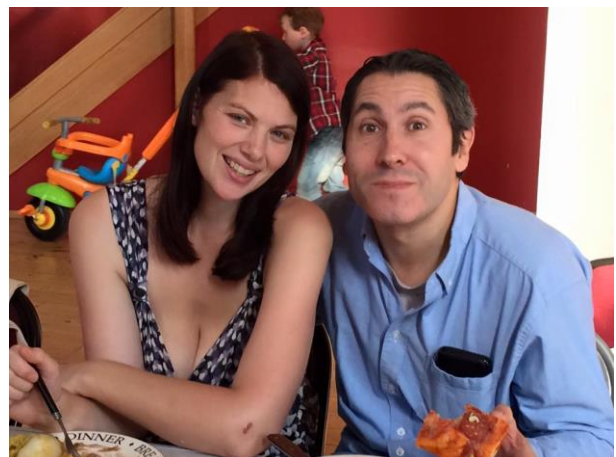
St John's folk

Did you know? Rev Dr John Bacchus Dykes, the great hymn-writer was born in Lime Street, then in Sutton Parish but now Drypool. His grandfather was vicar of the original St John's Church located in Hull City Centre. His tunes are still commonly used for "Holy, holy, holy! Lord God Almighty!", "We plough the fields, and scatter" and "Eternal Father, Strong to Save"