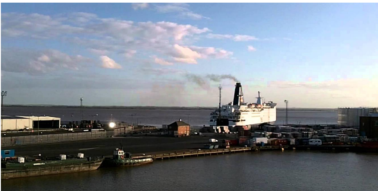
The Pride of York leaving east Hull bound for Zeebrugge