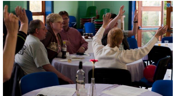
There is monthly Café Church at Vicky Dock