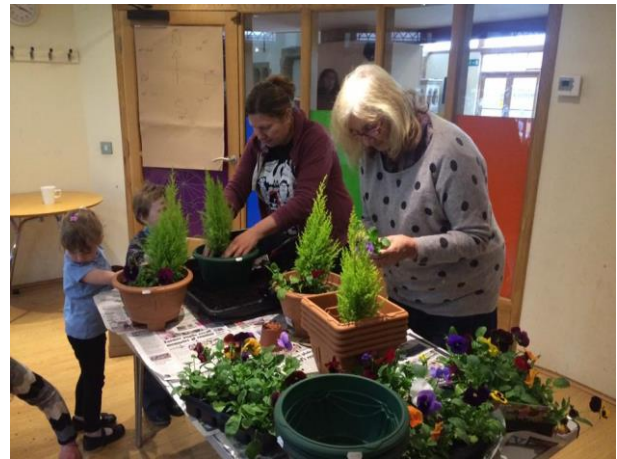
St John's garden club

Victoria Dock Church meets in an attractive Village Hall which is owned by the City Council but managed by a Community Association. The Church is able to use the building "by right" on a Sunday morning.