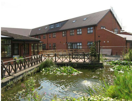
Dove House Hospice