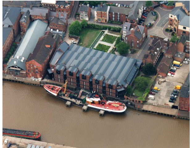
Arctic Corsair on River Hull by the Streetlife Museum