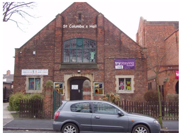
Church Hall (the original 1914 mission church)