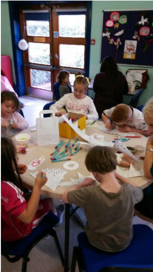
Messy Church at Vicky Dock

The present Team Vicar at St John's has oversight of the church on Victoria Dock. All members of the Ministry Team take services with one of the Readers, who worships there and another member of the Lay Leadership especially involved. The worship is usually modern but traditional hymns are also used. Various musicians help to lead the worship each week, including some from outside the parish.