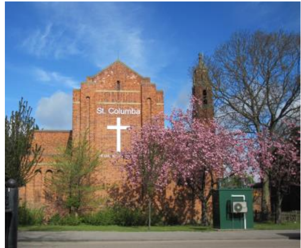
St C's from Holderness Road

A house in the Garden Village area is owned by the church, and has been let to the same family for approximately 45 years.