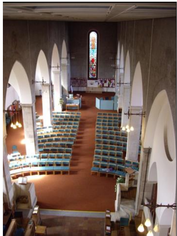
St Columba's interior