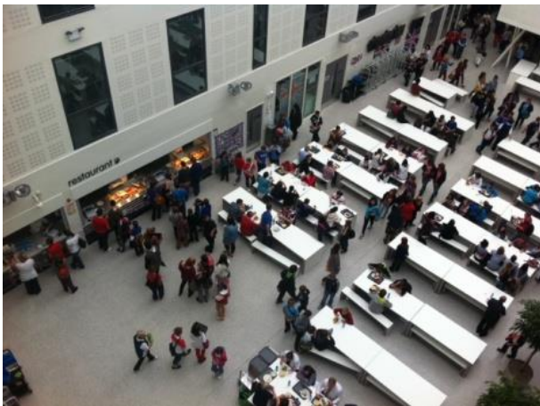
Archbishop Sentamu Academy

There is a sixth form college – Wilberforce , situated 2 miles from St Columba's, as well as a sixth form at Archbishop Sentamu Academy .