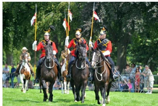
Annual Veterans Weekend at East Park