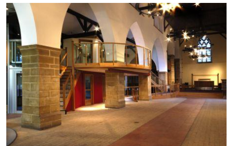
St John's interior

Its worship is modern and free including a monthly “charismatic” style evening service with an open invitation. It has a healthy Sunday School and a monthly Messy Type service followed by lunch together.