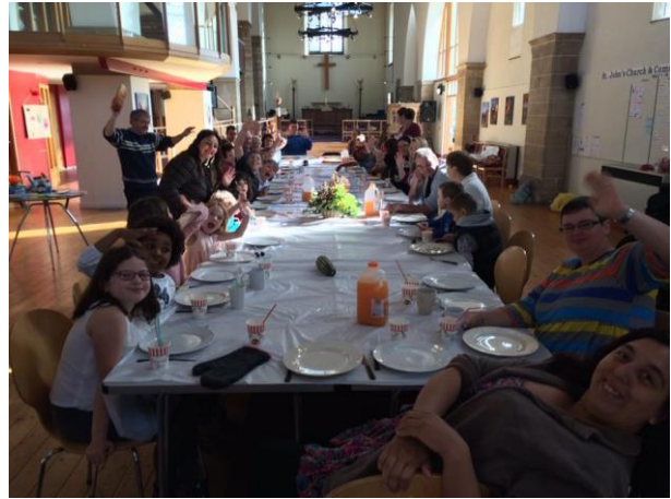
Monthly after service Sunday lunch

St John's worship is informal, contemporary, evangelical, using their own Worship Folder and Mission Praise. Robes are not usually worn. Sunday services start at 10:30 am. On the first Sunday of the month the "Together@St John's" service is followed by lunch. This is a messy type service which is used as a major invitation service. A Holy Communion service takes place on the second Sunday of each month, and Morning Worship on the other Sundays. There is a mid week Holy Communion on Wednesday mornings.