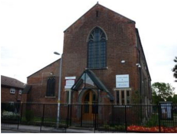
St John's Church, Rosmead Street

The building is a remarkable space with stage area and several function rooms. A mezzanine area offers yet more comfortable space. The Quinquennial inspection has just been completed and there are few critical or expensive repairs needed.