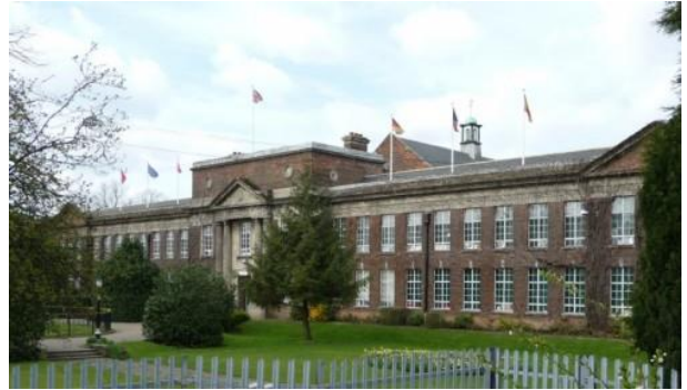
Malet Lambert School

The Archbishop Sentamu Academy and Malet Lambert School (named after a previous Archdeacon of the East Riding) are not far out of the Parish and for many are the secondary schools of choice. However, several Victoria Dock children are 'bussed' to the St Mary's Roman Catholic College in the north of the City.