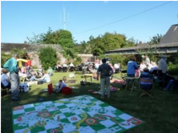
Rectory Garden Party

A single garage is interconnected to the whole building. There is a good sized enclosed garden with forecourt parking.