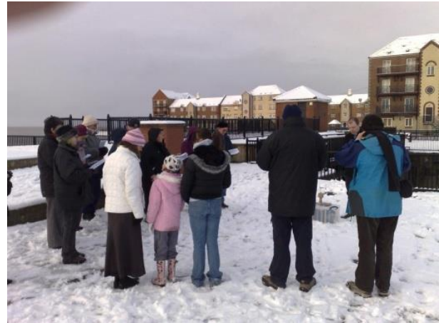
Snowy Easter sunrise service on the Dock

Average weekly Sunday attendance in 2014 was 20 adults and 3 children.