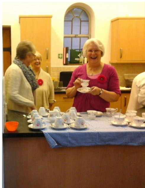
Kitchen at back of St Columba's Church

We would now like to share with you a little more detail about our city, our churches and neighbourhood.