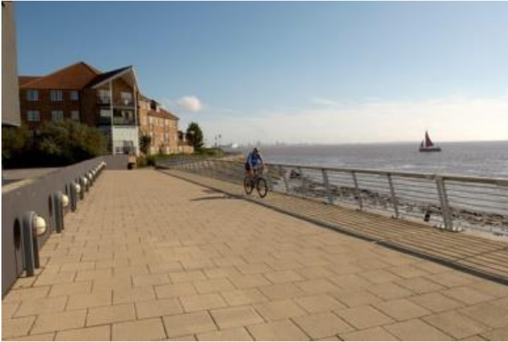
Victoria Dock Village Promenade

Victoria Dock Church (the newest of the Drypool three) is now well established and has a very welcoming and mature congregation which is very keen to reach out. One difficulty, which is also a potential strength, is that we have no building and use the Village Hall . Also, 27 years after construction of Victoria Dock Village on the old dock site began, the Dock has not really developed a central community. This leaves the door open for us to meet that need but it is quite difficult to find ways to engage with that community. We are earnestly seeking God for his way forward in this and are excited that LYCIG may be a tool to enable us to do so.