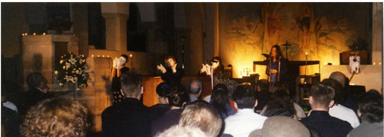
Local Christian drama group, Credo, at St Columba's

All the individual churches and as a Parish together are eager to make prayer and listening to God the foundation of our life and growth.