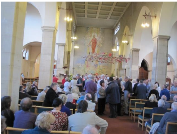
East Hull Confirmation Service at St C's

There are three church congregations in the Parish.