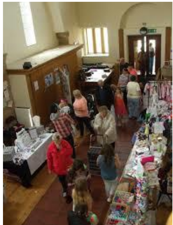
Fair at St John's

The closure of the David Lister secondary school has left the parish without such a school within its borders although significant provision exists nearby as detailed elsewhere. Positively there are exciting plans to develop an Integrated Care Centre on the resultant open land which is opposite St John's Church.