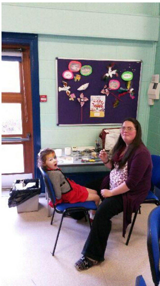
Face painting at Messy Church, Vicky Dock

In the last 12 months there have been 2 infant baptisms. In the previous year there were 4 infant baptisms, and 1 adult baptism.