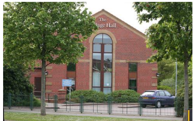
Victoria Dock Village Hall

Victoria Dock Church meets in an attractive Village Hall which is owned by the City Council but managed by a Community Association. The Church is able to use the building "by right" on a Sunday morning.