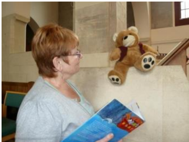
All Age Service

The service on the second Sunday is All Age Worship. Service of the word is used on fourth and fifth Sundays.