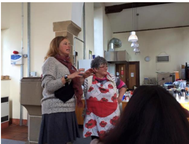
Who's nicked my piano?

Average weekly Sunday attendance in 2014 was 25 adults and 19 children.