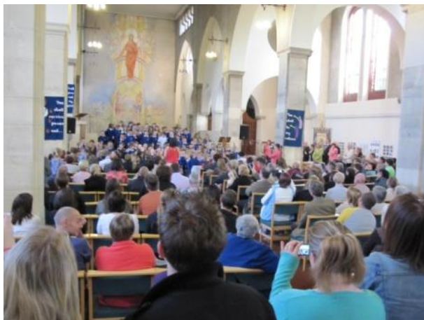
School concert in St C;s

The parish has involvement with all the primaries in the Parish and would like to see this maintained and developed. Beside individual class visits to the parish churches many of the schools hold carol services in the churches at Christmas producing high footfall numbers into the buildings.