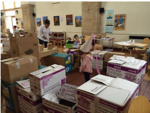
Box Challenge at St John's