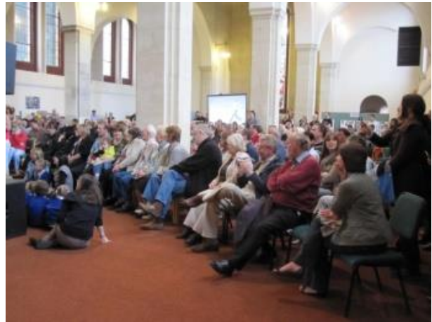
Children's concert at St C's

Each week we join together for our Sunday service from 10:30 am, and on Tuesday morning there is a Holy Communion service. The services on the first and third Sunday of each month are Holy Communion.