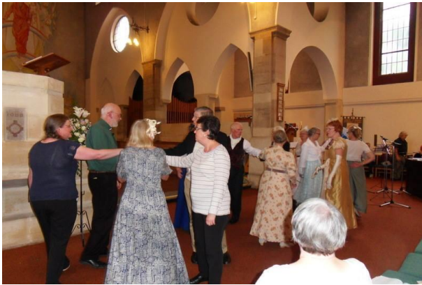
"You can dance like Darcy" with the Regency Dancers!