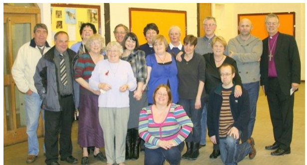
Confirmation candidates & supporters

St Columba's hosts prayer breakfasts on approximately four Saturday mornings a year which are well supported. There are regular lunches aimed mainly at the older retired members as a pastoral initiative which is being progressed into outreach. Each week a 'Company and a Cuppa' event draws people into the church and prayer is offered for those in need. Footfall during the week has improved significantly as a result.